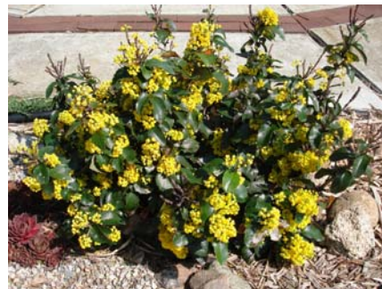
Mahonia (Oregon Grape Holly)