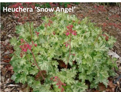
Heuchera 'Snow Angel'