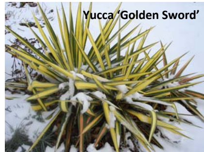
Yucca 'Golden Sword'