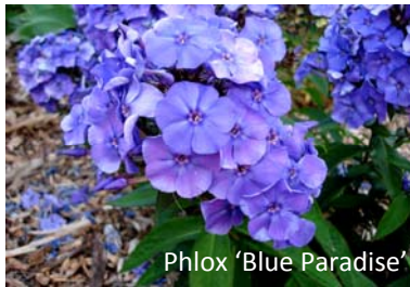
Phlox 'Blue Paradise'