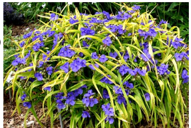
Tradescantia 'Sweet Kate' (Golden Spiderwort)