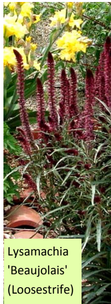
Lysimachia 'Beaujolais' (Loosestrife)