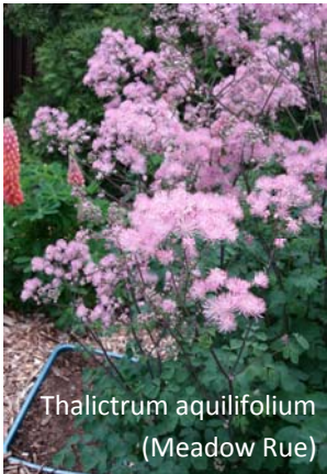
Thalictrum aquilifolium (Meadow Rue)