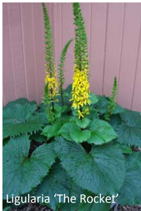
Ligularia 'The Rocket'