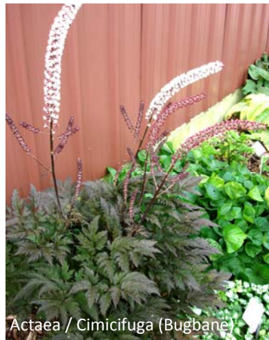
Actaea / Cimicifuga (Bugbane)