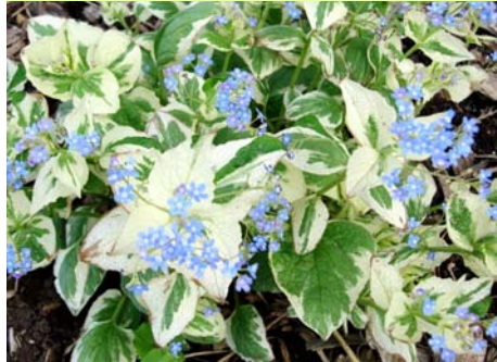
Brunnera macrophylla 'Variegata'