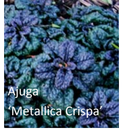
Ajuga 'Metallica Crispa'