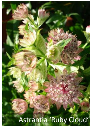
Astrantia 'Ruby Cloud'