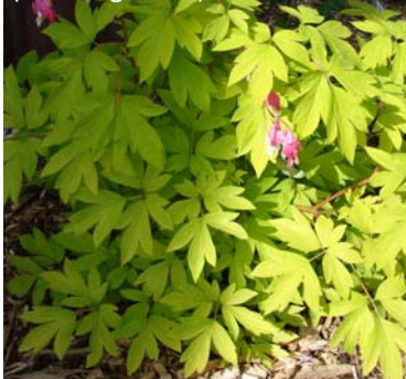
Dicentra 'Gold Heart' (Bleeding Heart)