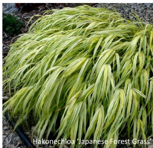
Hakonechloa 'Japanese Forest Grass'