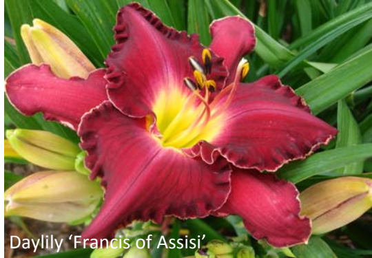
Daylily 'Francis of Assisi'