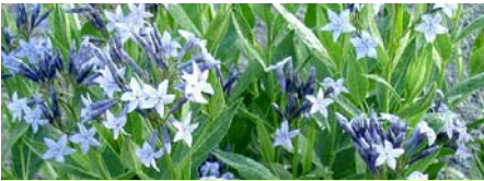
Amsonia 'Blue Ice' (Blue Star)