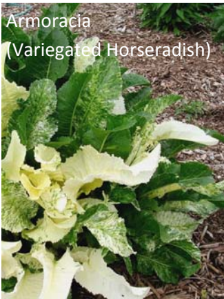
Armoracia (Variegated Horseradish)