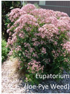
Eupatorium (Joe-Pye Weed)