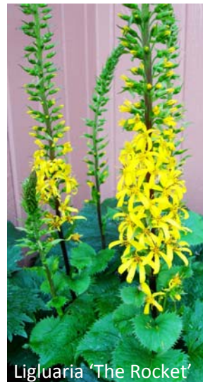
Ligularia 'The Rocket'