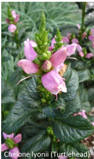
Chelone lyonii (Turtlehead)