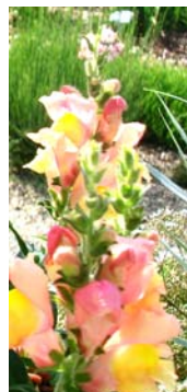
Antirrhinum Hardy Snapdragon