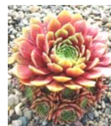
Hens & Chicks