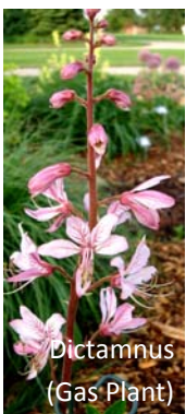
Dictamnus (Gas Plant)