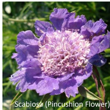
Scabiosa (Pincushion Flower)

Most Ornamental Grasses are deer resistant