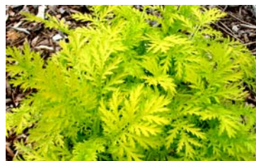
Tanacetum (Gold Leaf Tansy)