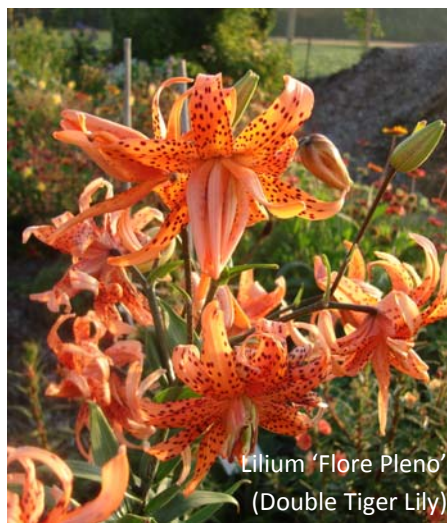
Lilium 'Flore Pleno' (Double Tiger Lily)