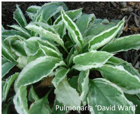
Pulmonaria 'David Ward'