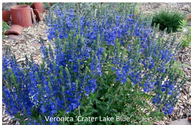
Veronica 'Crater Lake Blue'