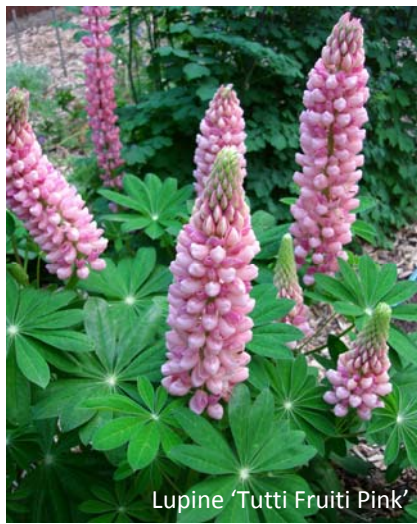
Lupine 'Tutti Frutti Pink'