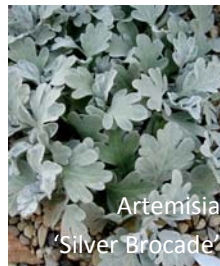
Artemisia 'Silver Brocade'