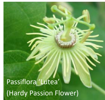
Passiflora 'Lutea' (Hardy Passion Flower)