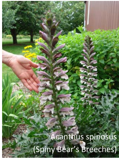
Acanthus spinosus (Spiny Bear's Breeches)