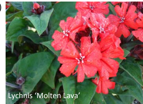
Lychnis 'Molten Lava'