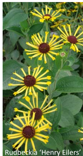
Rudbeckia 'Henry Eilers'