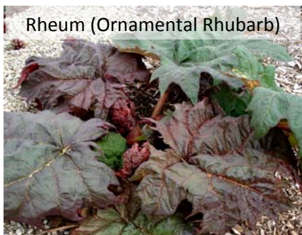
Rheum (Ornamental Rhubarb)