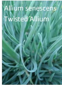
Allium senescens Twisted Allium