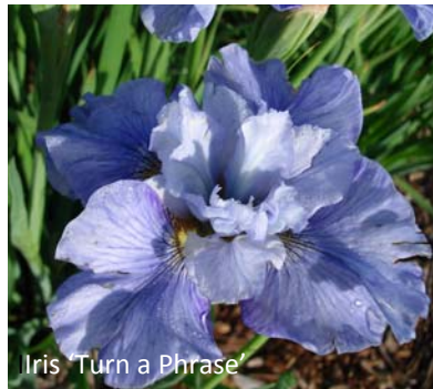
Iris 'Turn a Phrase'