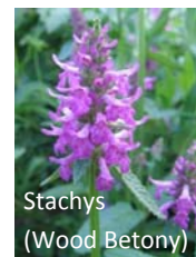
Stachys (Wood Betony)

Pycnanthemum (Mountain Mint) Ranunculus (Buttercup) Ratibida (Mexican Hat Flower) Rodgersia (Rodger's Flower) Rudbeckia (Coneflower) Rumex (Red-Veined Sorrel) Salvia nemerosa (Sage) Sanguisorba (Burnet) Sedum