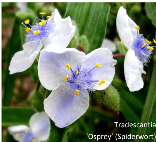
Tradescantia 'Osprey' (Spiderwort)

Helenium (Helen's Flower) Helianthus (Perennial Sunflower) Heliopsis (Perennial Sunflower) Hellebore (Lenten Rose) Hemerocallis (Daylily) Hesperis (Dame's Rocket) Heuchera (Coral Bells) Iris (Bearded Iris) Kalimeris Kniphofia (Red Hot Poker) Lamium (Dead Nettle) Leucanthemum (Shasta Daisy) Ligularia (Leopardbane) Lobelia (Cardinal Flower) Lysimachia (Loosestrife) Lythrum (Loosestrife) Mentha (Mint) Monarda (Bee Balm) Oenothera (Evening Primrose) Pachysandra Penstemon 'Husker's Red' Persicaria (Fleeceflower) Petasites (Sweet Coltsfoot) Phlox Physostegia (Obedient Plant) Polemonium (Jacob's Ladder) Polygonum (Mexican Bamboo) Polygonatum (Solomon's Seal) Potentilla (Cinquefoil) Pulmonaria (Lungwort)