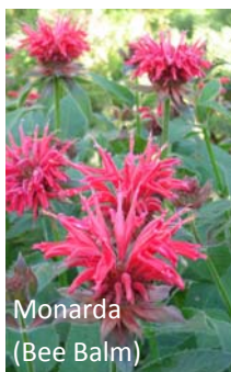
Monarda (Bee Balm)

Acanthus (Bear's Breeches) Achillea (Yarrow) Actaea / Cimicifuga (Bugbane) Ajuga (Bugleweed) Alcea (Hollyhocks)—will get MUCH taller and more spectacular in clay soils. Alchemilla (Lady's Mantle) Amsonia (Blue Star) Anchusa (Bugloss) Anemone (Windflower) Angelica Armeria (Thrift) Asclepias (Milkweed) Aster Astilbe (False Spirea) Athyrum (Japanese Painted Fern) Bamboo Belamcanda (Leopard Lily) Bergenia (Pigsqueak) Brunnera (Bugloss) Campanula (taller species) Chrysanthemum (Mum) Chelone (Turtlehead) Coreopsis verticillata 'Zagreb' Eryngium (Sea Holly) Eupatorium (Joe-Pye Weed) Euphorbia (Spurge) Filipendula (Meadowsweet) Geranium (Hardy Cranesbill) Geum