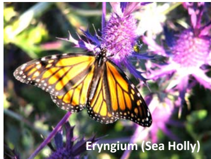
Eryngium (Sea Holly)