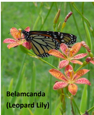
Belamcanda (Leopard Lily)