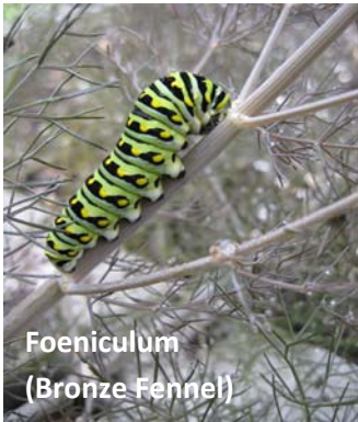
Foeniculum (Bronze Fennel)

Many of these plants are also important nectar sources for bees and other insects.